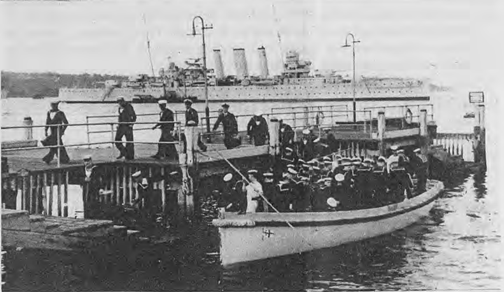
HMAS Canberra in Sydney Harbour and libertymen landing at Man O' War Steps, near where the Opera House now stands.