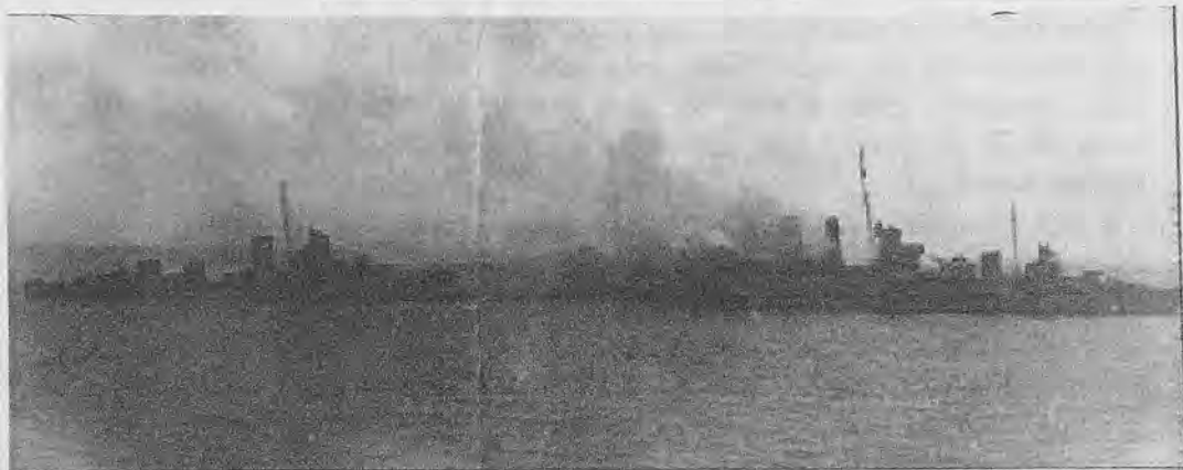
Listing and burning, 'Canberra' awaits her final destruction by American shells and torpedoes, in the dawn light of 9 th . August, 1942. She went to her final resting place in "Iron bottom sound" taking with her the bodies of those who had been killed and the personal kit and belongings of most of her surviving crew.